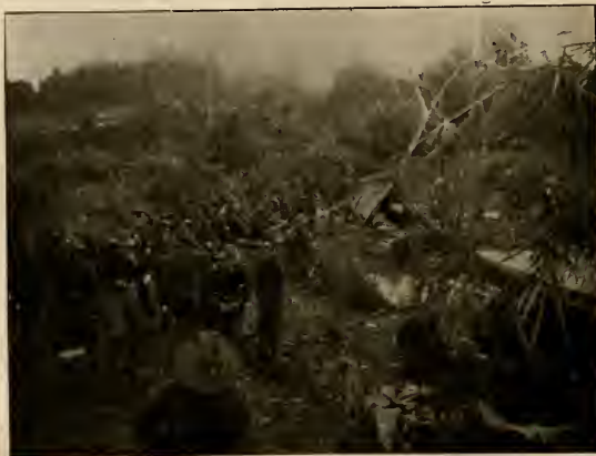
Just before the charge at Caloocan.